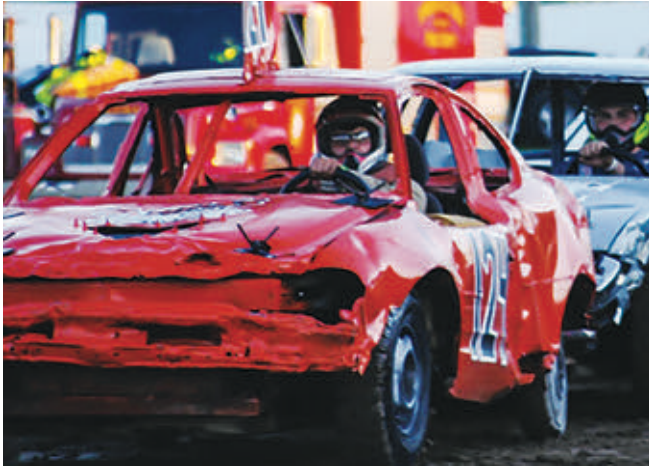
Figure 8 Demolition Derby Races take place Wednesday night in front of Grandstand

The popular Figure 8 Demolition Derby Races will take place Wednesday night, July 26, in front of the Grandstand. The action starts at 8 p.m. Admission to the show is $15 per person, with kids 4 and under admitted free.