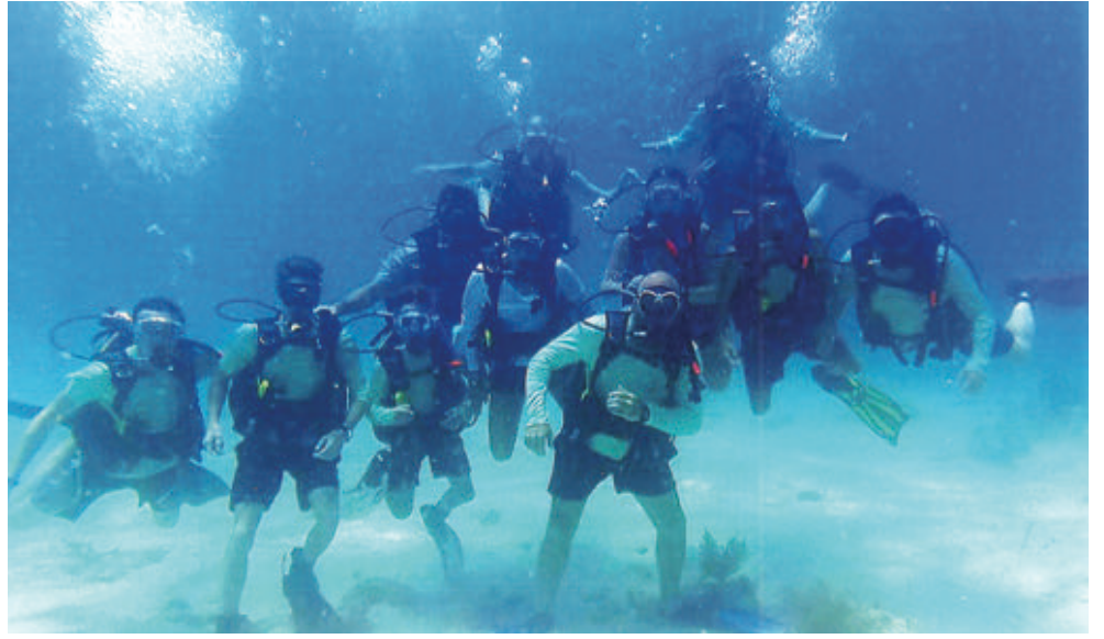
Here are the Scouts underwater.