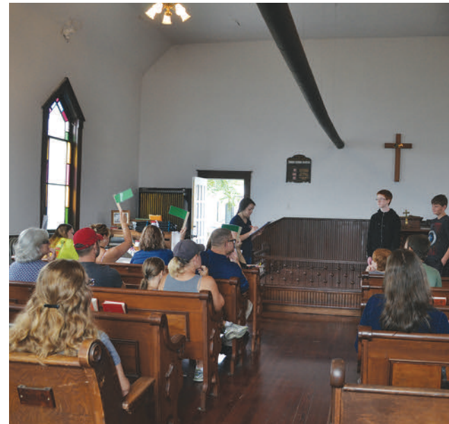
The Ventra Community Spelling Bee will be held on Friday, July 28 in the Iosco Methodist Episcopal "Green" Church in the Historical Village on the north side of the fairgrounds.

Another fun event will be a draft horse-drawn cart ride around the back of the grounds. The pick-up will be near the new bathrooms. The rides will be provided from 7 to 10 p.m., Wednesday thru Saturday.