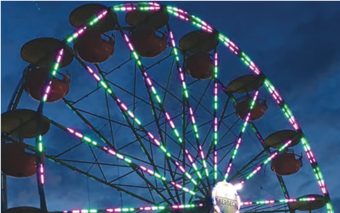
The midway is open Tuesday - Saturday, July 25-29 and operated by Skerbeck Entertainment Group.

137 th Annual Fowlerville Family Fair runs from Monday thru Saturday, July 24-29