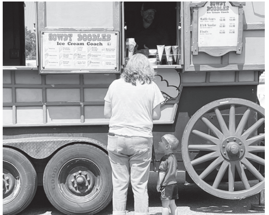
It's ICE CREAM DAY at this Sunday's Eastern Ingham Farmers Market in Williamston. Stop by and treat yourself and the kids to Howdy Doodles Ice Cream and their perfect selection of ice cream products served from an old fashioned stage coach.

The Market ambience is pleasantly improved with live music performed by volunteers each Sunday for 2-hour gigs. This Sunday, Mellow Market Music will be provided from 10am