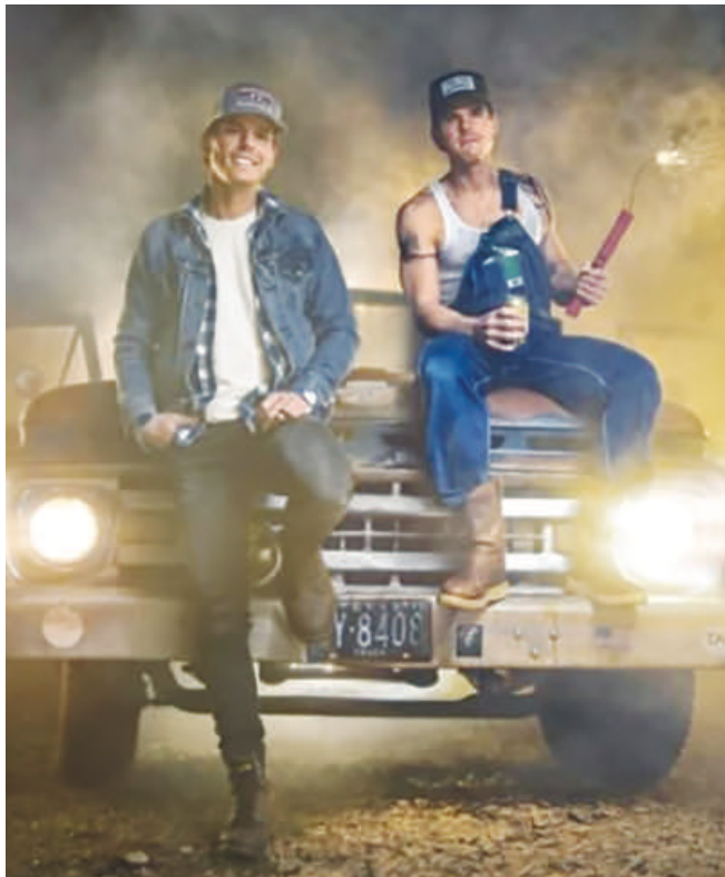
Granger Smith with Earl Dibbles Jr. will be performing in front of the Grandstand on Saturday, July 29.