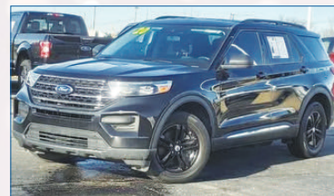
2020 FORD EXPLORER XLT 4X4 3rd row seating. Stk. # W5067P Now ..... $31,925