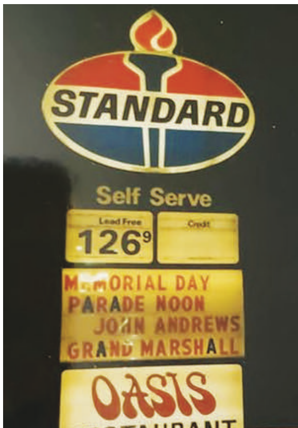
The sign for self-serve gas.