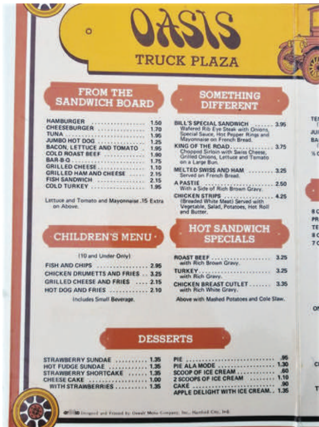
This was the menu. A favorite was the hamburger deluxe.