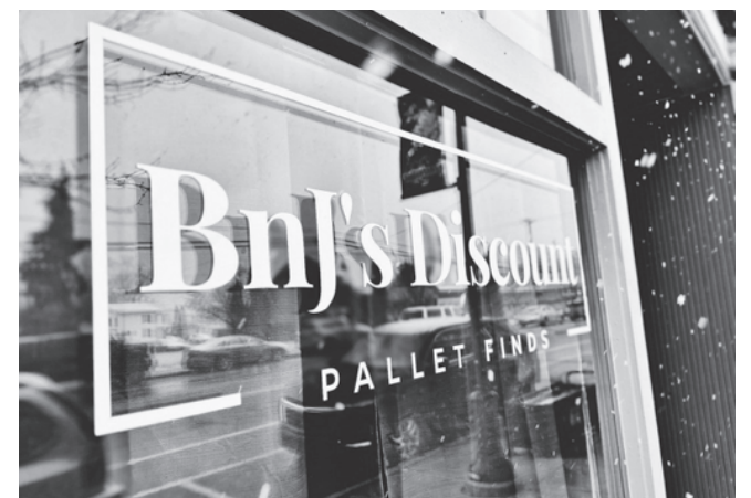
BnJ’s Discount Pallet Finds had a Grand Opening last Saturday, March 4 th , at its Downtown Webberville location.

The Webberville United Methodist Church, located at 4215 East Holt Rd., is having a ‘drive through’ chicken dinner on Saturday, March 18. The dinner includes 2 pieces oven fried chicken, mashed potatoes, chicken gravy, green beans, corn casserole, coleslaw, roll and cookies. All for $10. The dinner will be served 5 to 7 PM or until we run out.