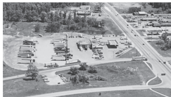
Aerial shot.