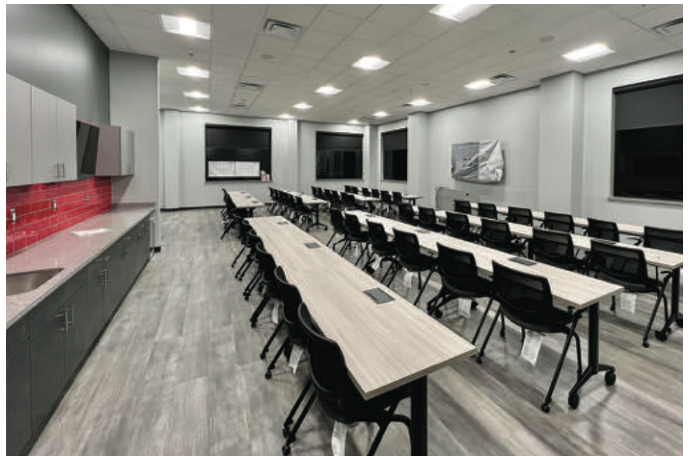
The meeting room at the new Fowlerville Fire Station 41.