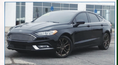
2017 FORD FUSION Low price. Stk. # W5126Q Now ..... $15,989

CHECK OUT OUR BOB MAXEY FORD GREEN TAG SERVICE SPECIALS FOR MARCH: