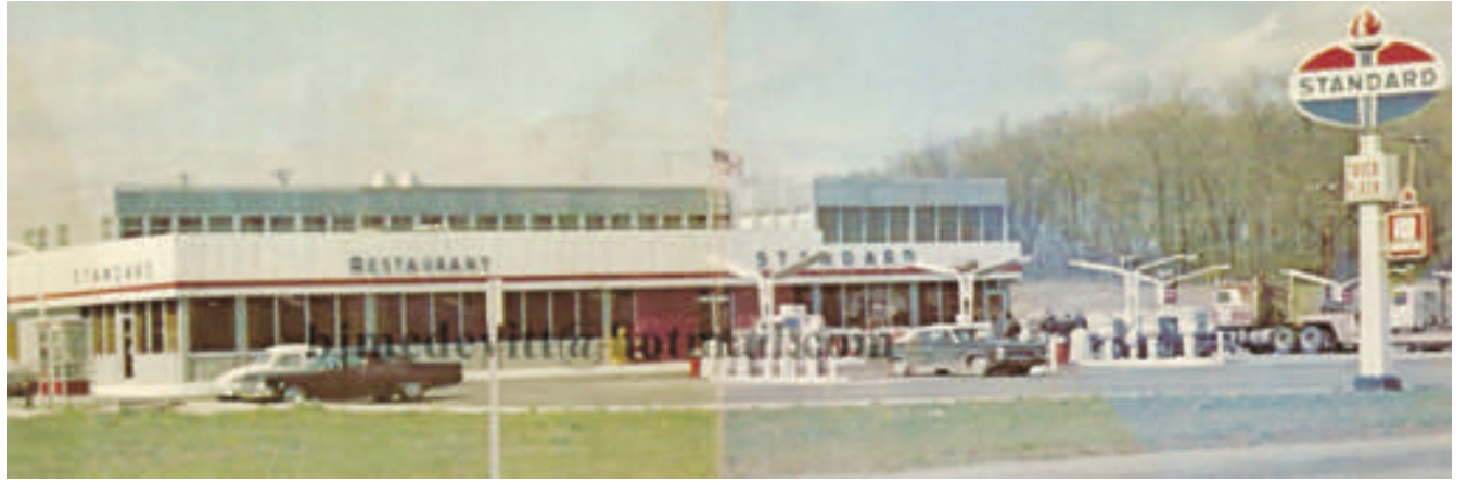
Truck stop in the 1960's.