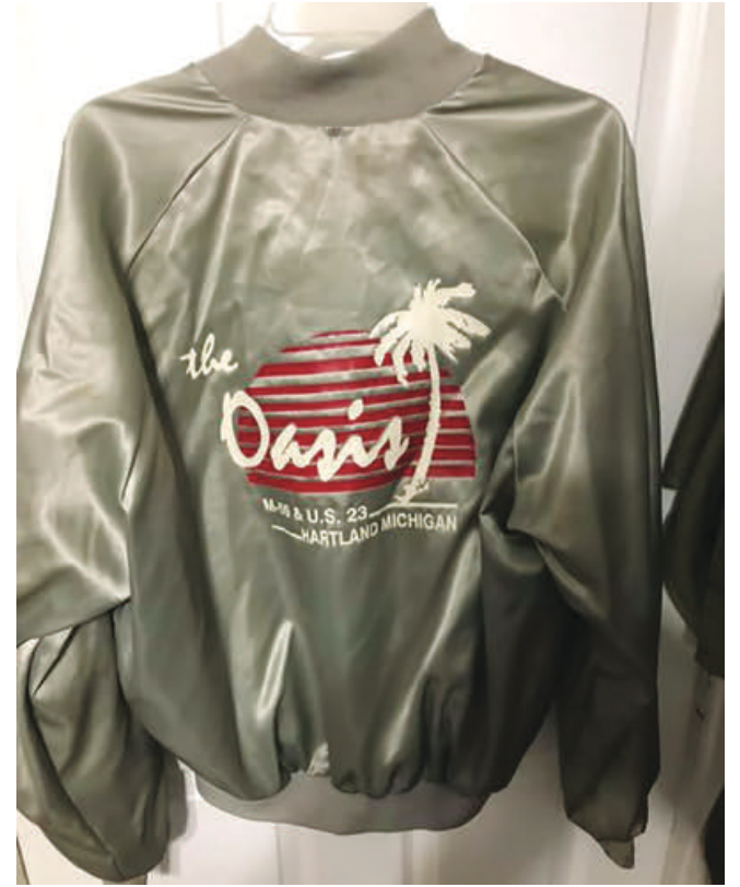
Cool jacket from the 1980's.

I wish the truck stop was still there. It was a great gathering place.