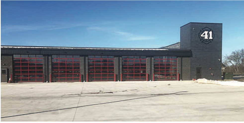
The new Fowlerville Fire Station 41 is expected to become operational this coming week.