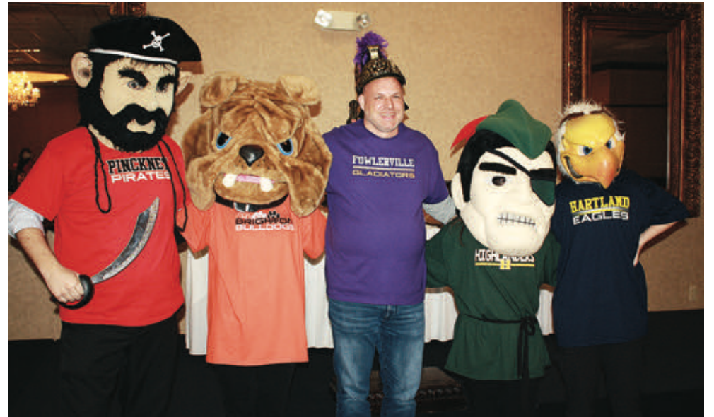
These mascots from the five Livingston County public schools helped 'liven up' the audience during the meeting. They included the Pinckney Pirates, Brighton Bulldogs, Fowlerville Gladiators, Howell Highlanders, and Hartland Eagles.