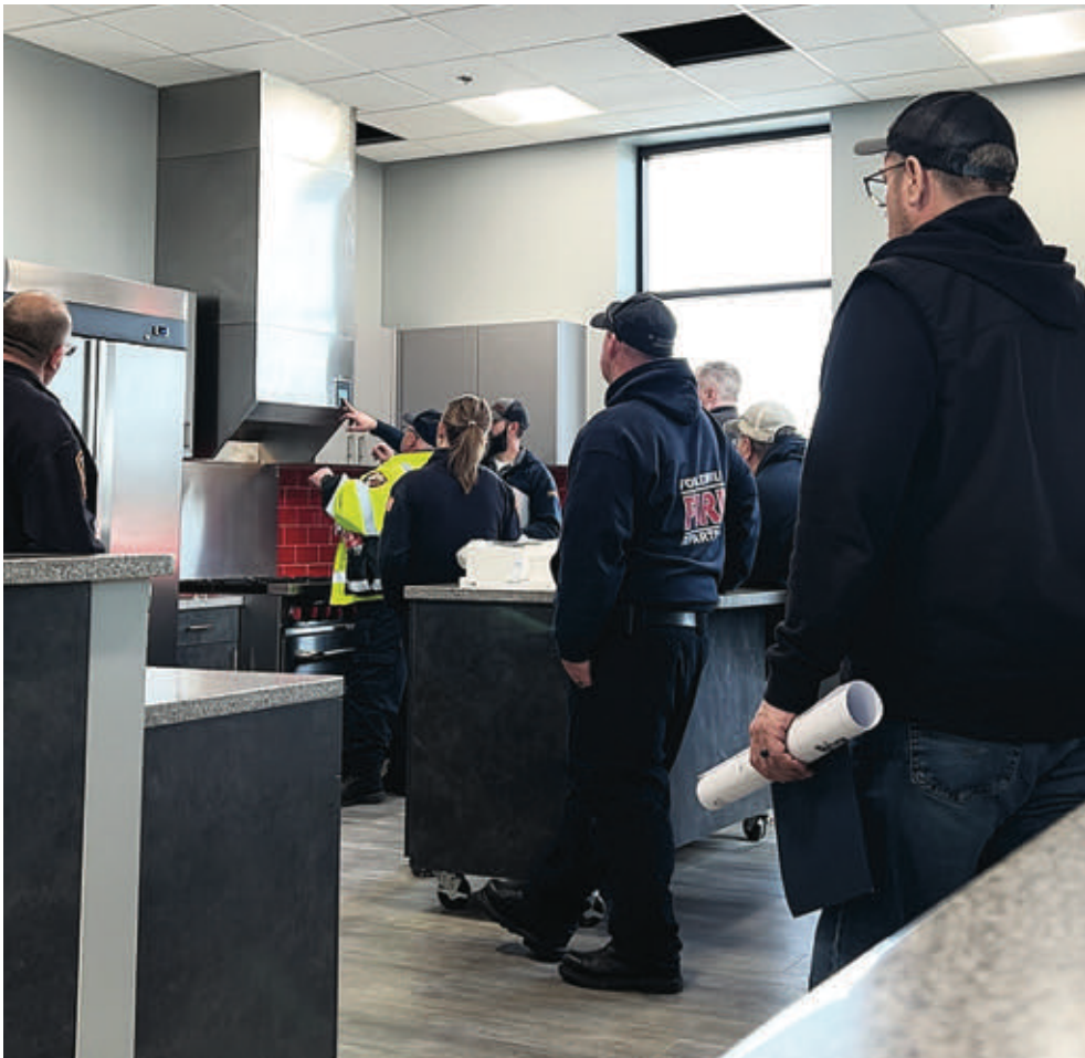
Staff get a tour of the kitchen of the new fire station.