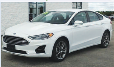
2020 FORD FUSION SEL Low miles, great MPG!! Stk. # W5012P Now ..... $16,989