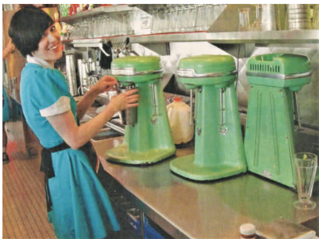
The malt machines we used. Do not remember the girl's name but this was the uniform we wore.