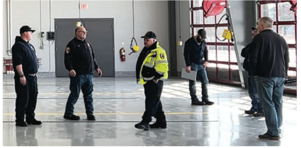
Fowlerville firefighters inspect the inside bays of the new fire station.