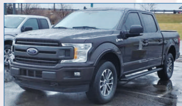
2020 FORD F150 4X4 Don't miss this deal!! Stk. # W5121P Now ..... $38,989