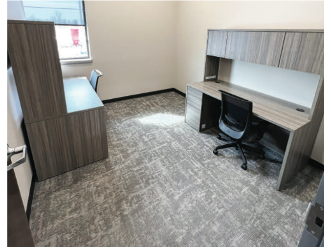
An office inside the new fire station.