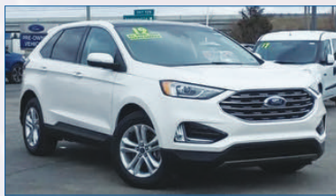
2019 FORD EDGE SEL Great ride and priced right!! Stk. # W5123P Now ..... $27,990