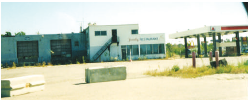
Restaurant closed up.