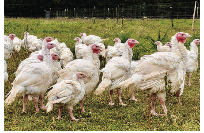
Turkeys roaming on the Cook Family Farm in Gaylord.