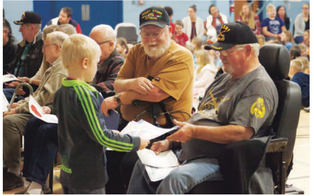
Students offer their artwork to the veterans.