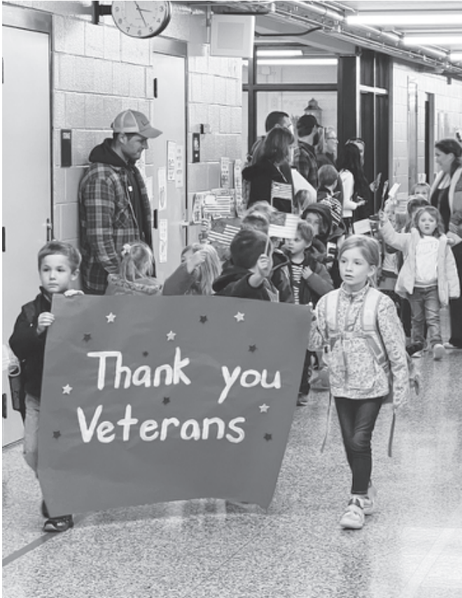
Smith Elementary students observed a “silent dismissal” during their Veterans Day activity.