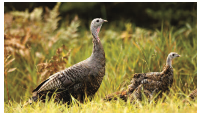
Wild turkeys sitting in a Michigan field.

"Everything we make here is homemade, all from scratch. You can get your whole Thanksgiving turkey meal here. Our turkeys are all natural, never been frozen, and fresh," he said. "I don't even get them until the week of the holiday."