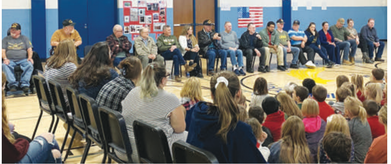
Veterans share their service background and stories with students