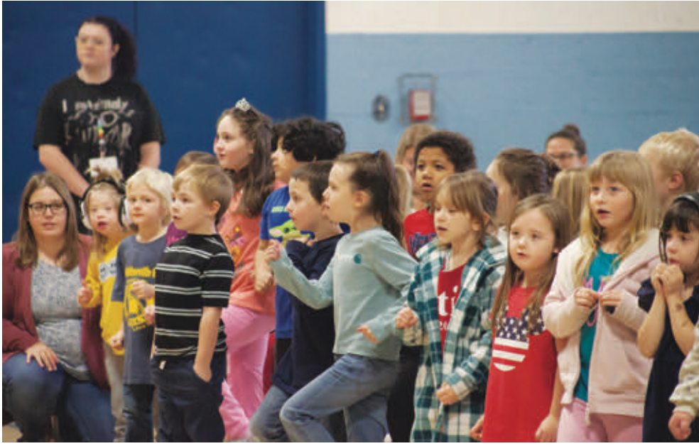
First graders march as they sing the 'Armed Forces Medley'