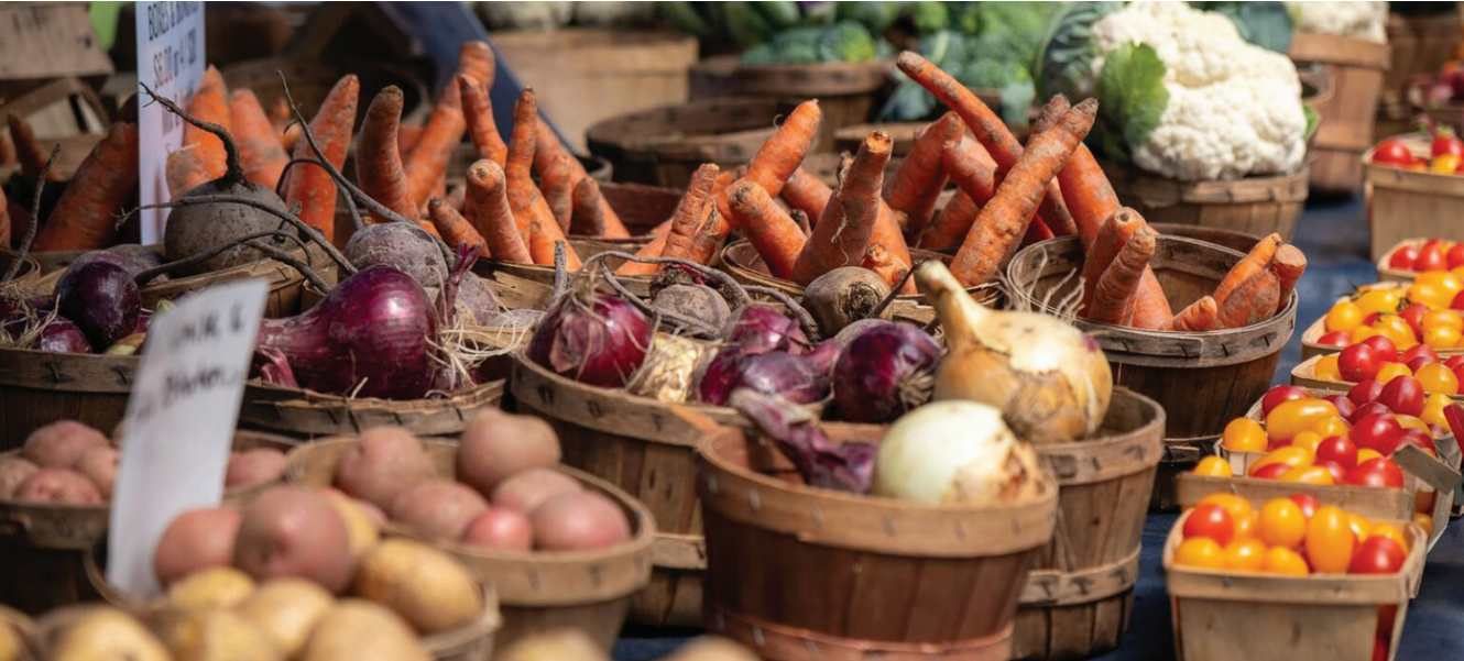
Farmers Market at the Capitol in Lansing.