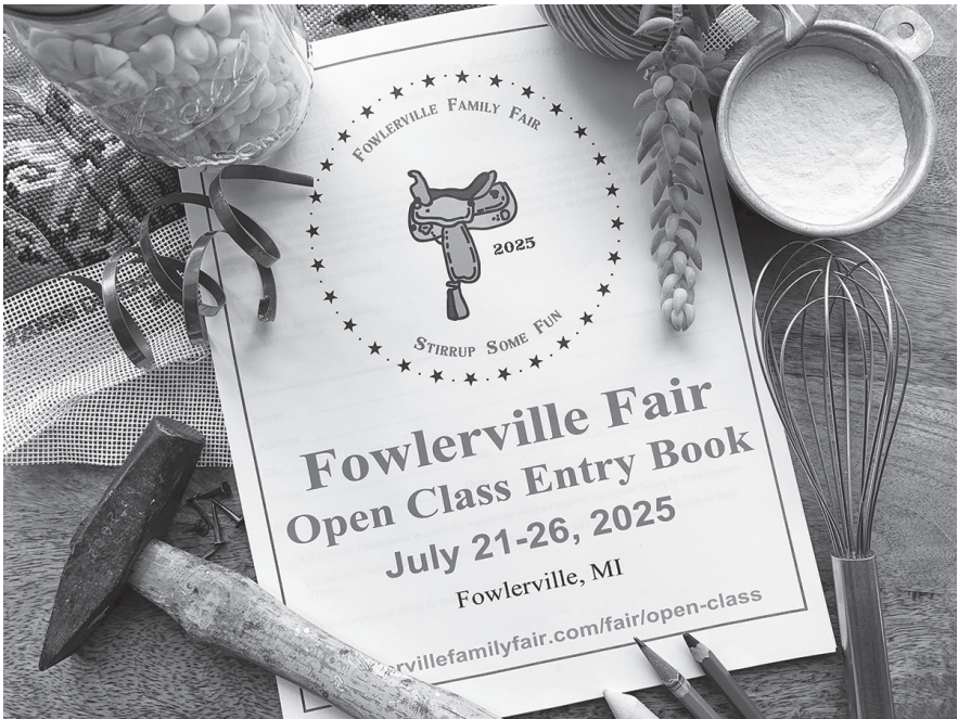
The Fowlerville Fair Open Class Entry Book has undergone a major overhaul, with over 100 new classes added.

And even beyond Entry Book changes, there are improvements to Entry Tags, Exhibit drop-off schedules, registration timelines, the Exhibitor Reception, and much