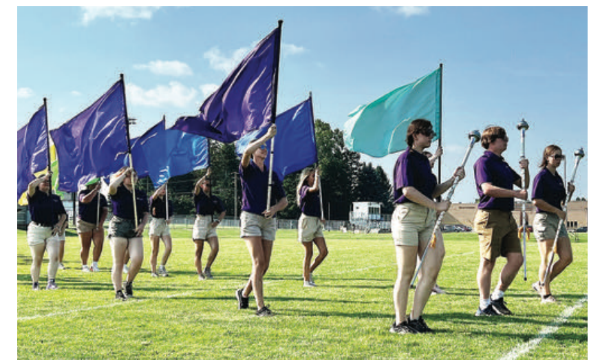
The band worked on the various routines for the new show.

This year's show is titled "The Land of Sleep and Dreams." It includes music 'Teenage Dream' by Katy Perry, 'Enter Sandman' by Metallica, 'Wake Me Up' by Wham!, and 'Dream On' by Aerosmith. Each year, different sections of the band compete in games like egg toss, musical chairs, and an obstacle course (among others). The games end with a march-off during the band showcase.