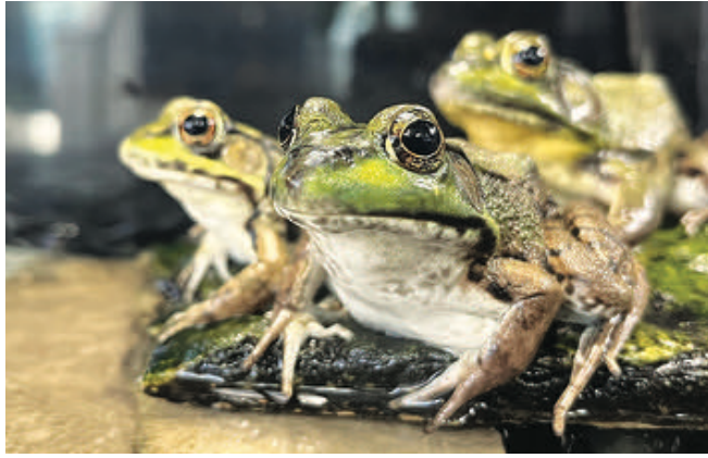
These Michigan green frogs from Nature Discovery may be a part of their special exhibit at this Sunday's (August 13 th ) Eastern Ingham Farmers Market in Williamston, as the Market wraps up National Farmers Market Week.